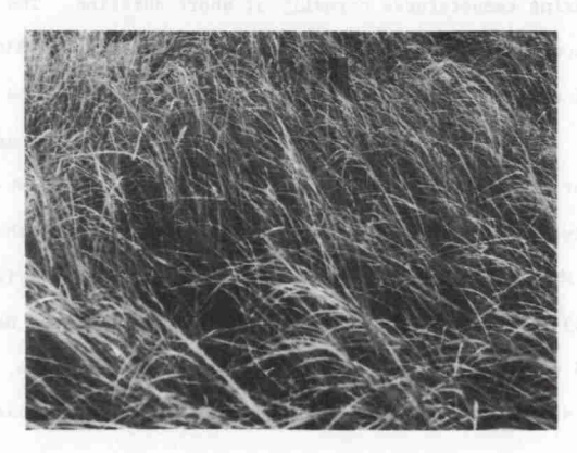
Figure 12-1. Coastal bermudagrass

Few introduced grasses have gained as wide usage as Coastal bermudagrass (Figure 12-1). The wide adaptation of Coastal is shown by its satisfactory performance