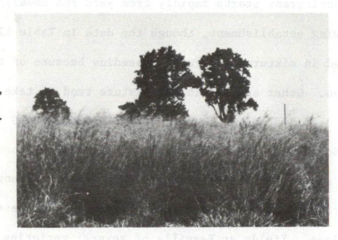
grass is leafy and has good drouth Figure 12-2. Kleingrass 75 resistance. Poor seed production has prevented Pretoria-90 from becoming extensively used. It produces two seed crops per year which vary from 10 to 20 percent in pure live seed.

Pretoria-90, the highest yielding of those species tested, is adapted to all of South Texas. Pretoria-90 is an introduced bluestem which begins growth early in the spring and remains green late in the fall. The