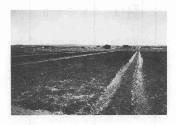
Figure 13-6. Irrigated alfalfa in Pecos County.

every second year. An interesting aspect of this trial is that the lowest rate of phosphorus and the most extended irrigation period of 28 days gave an average yield of 7.66 tons. This yield is considerably higher than the average yield of about 4.5 tons per acre throughout the El Paso Valley. These results suggest that factors other than irrigation and phosphorus may affect yields in the area.