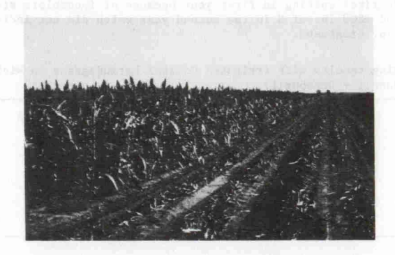
Figure 13-2. Sorghum hybrids for silage are grown on approximately 11,000 acres in the Rolling Plains.

Forage sorghum hybrids are essentially the only crops in the Rolling Plains utilized for silage (Figure 13-2). Although corn is generally considered to make higher quality silage, it is not well adapted to the Rolling Plains because of the high temperatures and limited rainfall. Approximately 18,000 acres of sorghum hybrids are grown with an average yield of 7 tons per acre. Under irrigation and high level management, 15 to 17 tons per acre are produced. While production costs and silage value will change with the economy, silage is not a high cash return crop (Table 13-9). Consequently, most of the silage produced is used in small feedlots or for on-the-farm feedings.