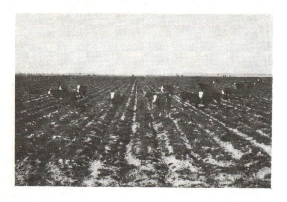
Figure 13-7. Cattle grazing alfalfa during the winter in Ector County.