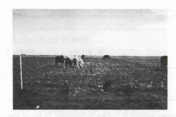
Figure 13-5. Stocker cattle grazing barley. Because of its salt tolerance barley is the small grain most often grown in the Trans-Pecos region.

established under dryland conditions and frequently grazed by lambs. In the area west of the Pecos River, all of the forages, both winter and summer, must be irrigated. Therefore, growing stocker beef cattle is about the only practical animal production program since all the gain from stockers is sold contrasted with only the calf gain in cow-calf operations. Approximately 100,000 acres of irrigated cropland in the Pecos and El Paso areas and limited acreages in other parts of the area are used for forage.