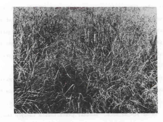
rigure 13-1. Kleingrass

Perennials: Improved perennial grasses in the Rolling Plains have been largely limited to bermudagrasses until recent years. Kleingrass (Figure 13-1) and love-grasses are creating considerable interest because of their longer growing seasons. Bermudagrass is not ready for grazing or haying until mid-May or early June and stops growth in September. Since cattle are removed from wheat pasture about March 1-10 and since native pastures and bermudagrass are not ready for grazing at this time, a gap exists in forage availability between March 1 and June 1. Love-grass and kleingrass show potential of filling this gap and extending the growing season further into the fall.