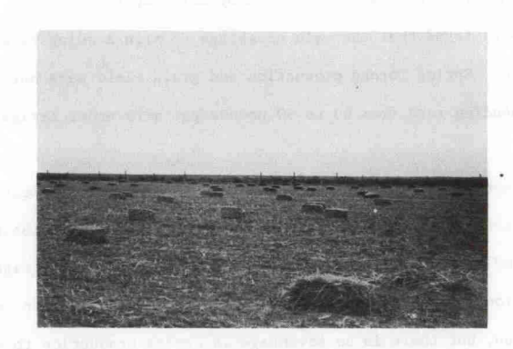
Figure 13-4. Baled forage sorghum occurs in a range of quality depending on plant maturity and weather conditions. The thick pithy stems require a long drying period to avoid spoilage after baling.

In the High Plains, approximately 133,000 acres of silage crops were grown in 1971 (New, 1971) with 99,456 acres of this being in corn. Information on the comparative productivity under High Plains conditions of the many summer annual forages is not available. In the Panhandle such forages are usually produced after harvest of a wheat crop with little attention given to soil fertility and a low priority to irrigation. Drouth stress sometimes results in accumulation of lethal levels of nitrates in both hay and grazed forage. Frost damaged regrowth causes temporary danger from hydrocyanic acid.