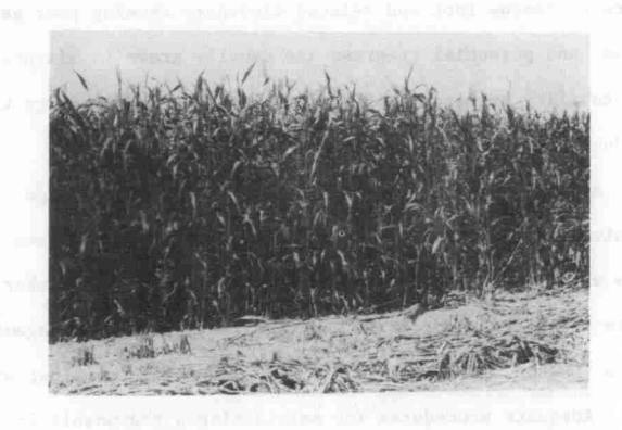
Figure 13-3. A good stand of sorghum-sudangrass hybrid in early heading stage being windrowed in preparation for baling. This crop was produced on Pullman clay soil with two irrigations.

Under irrigation, yields of the sudans and sorghum-sudan hybrids (Figures 13-3 and 13-4) range in yield from 3.5 to 6.0 tons of dry forage per acre (Rosenow, 1965; Walker, 1968). Yields under dryland conditions range from 0.8 to 1.8 tons dry forage per acre (Mitchell County, 1972).