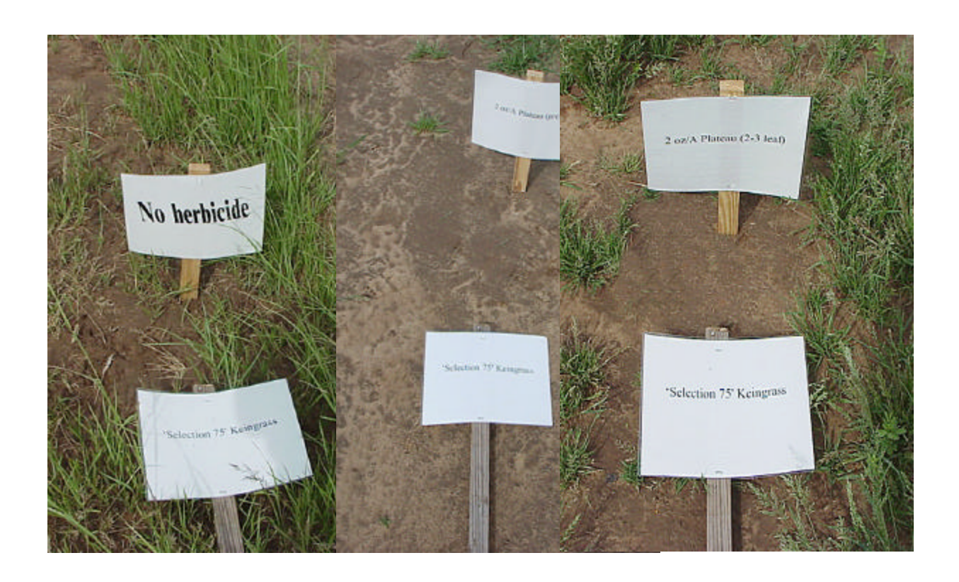
Figure 3. No herbicide, pre-plant, and 2-3 leaf stage application timing of Plateau on kleingrass.