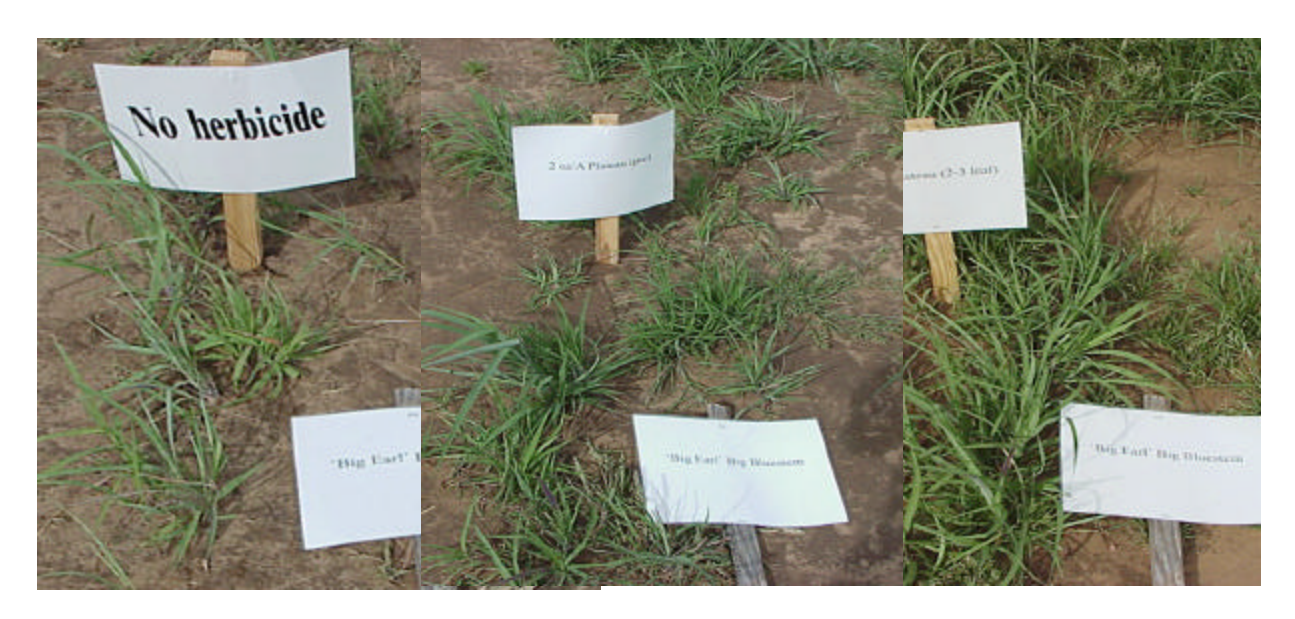
Figure 1. No herbicide, pre-plant, and 2-3 leaf stage application timing of Plateau on big bluestem.