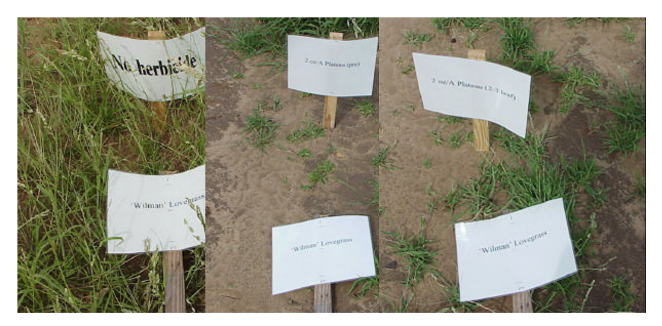
Figure 4. No herbicide, pre-plant, and 2-3 leaf stage application timing of Plateau on Wilman lovegrass.